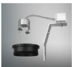
ACOT-82 MR16 Accessory kits