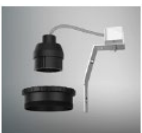
ACOT-83 GU10 Accessory kits