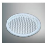
SG7-1 Striped glass