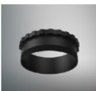
PJ-0079 MR16&GU10 Accessory