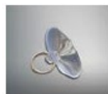
ACOT-109 Suction cup