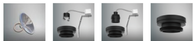
ACOT-108 Suction cup