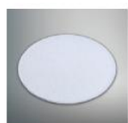
ACDS-3 Diffusion sheet