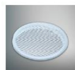
ACSG-5 Striped glass