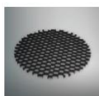
ACHO-6 Honeycomb louver