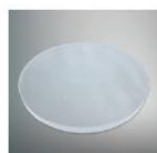
ACWG-6 Woven glass