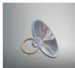
ACOT-107 Suction cup