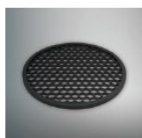
ACHO-5 Honeycomb louver