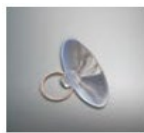
ACOT-108 Suction cup