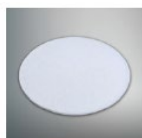
ACDS-4 Diffusion sheet