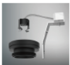
ACOT-103 MR16 Accessory kits