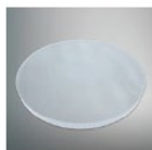
ACWG-5 Woven glass