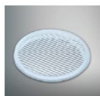
ACSG-4 Striped glass