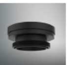
PK-0250 MR16&GU10 Accessory