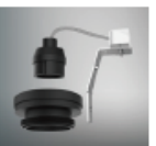
ACOT-104 GU10 Accessory kits