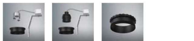
ACOT-82 MR16 Accessory kits