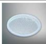
SG-002 Striped Glass