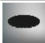
ACHO-18 honeycomb louver +PC sheet