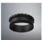
PJ-0079 MR16&GU10 Accessory