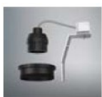
ACOT-83 GU10 Accessory kits