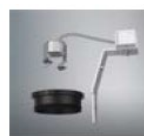
ACOT-82 MR16 Accessory kits