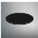
ACHO-18 honeycomb louver +PC sheet