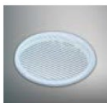
SG-002 Striped Glass