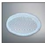
SG7-1 striped glass