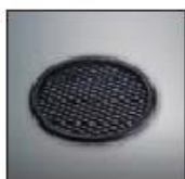
H7-1 honeycomb louver