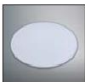
DS7-1 diffusion sheet